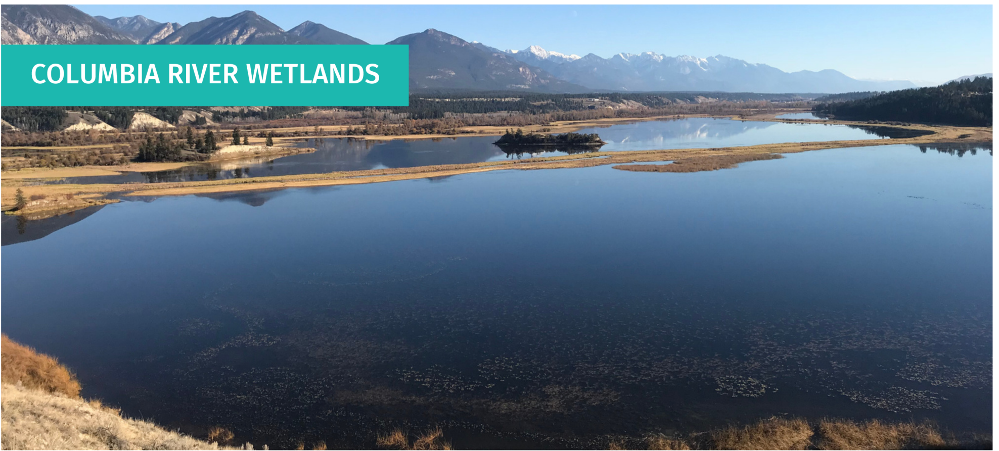
Columbia Wetlands.

The transboundary Columbia River stretches 2,000 kilometres, travelling through one Canadian province and seven U.S. States before discharging into the Pacific Ocean in Oregon.