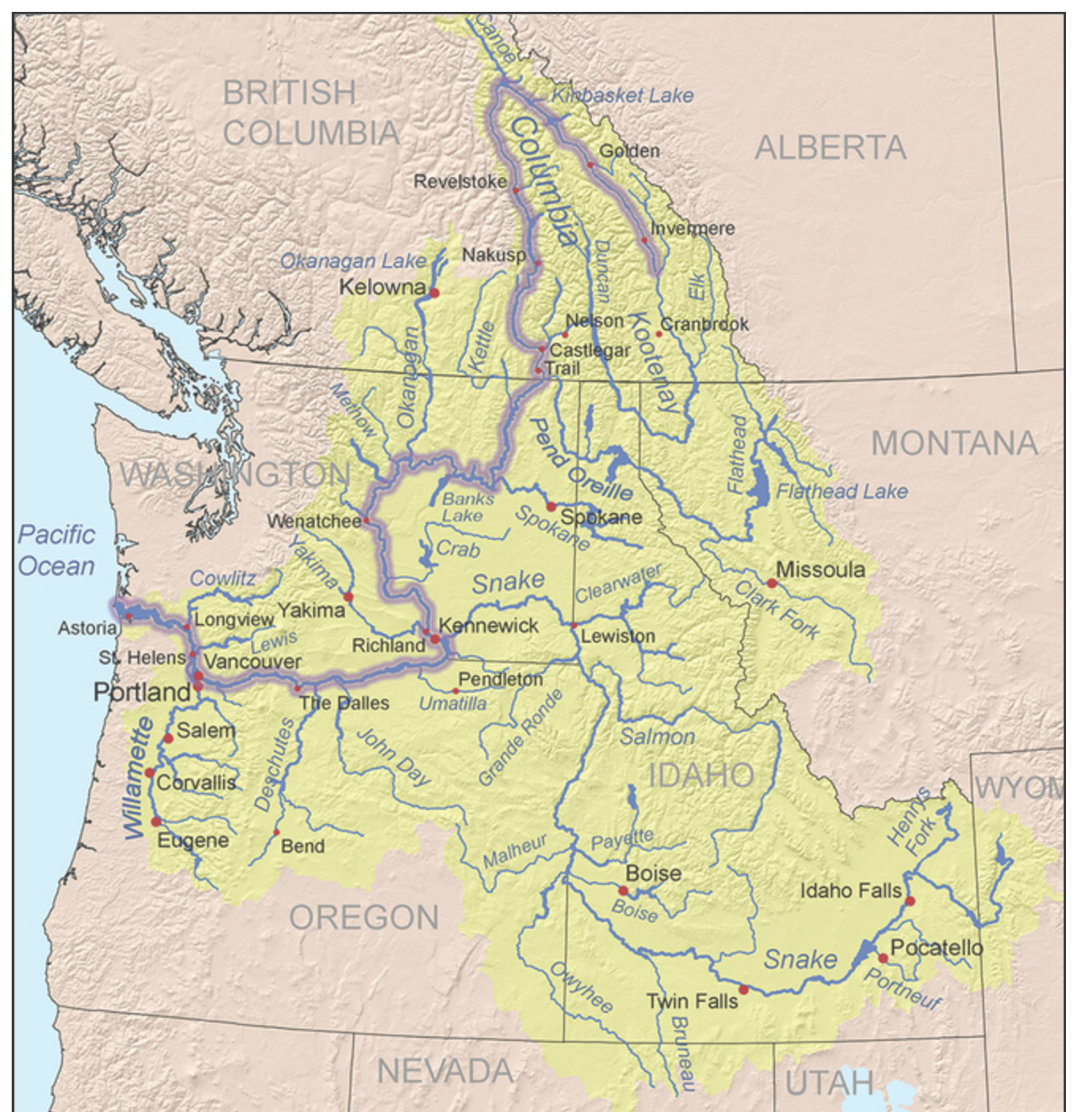
A map of the Columbia River watershed with the Columbia River highlighted, by Kmusser (Citation 2008), Body. 0.CC BY-SA 3.

Overall, the Columbia River drainage basin covers a vast area of over 668,000 square kilometres (258,000 square miles).