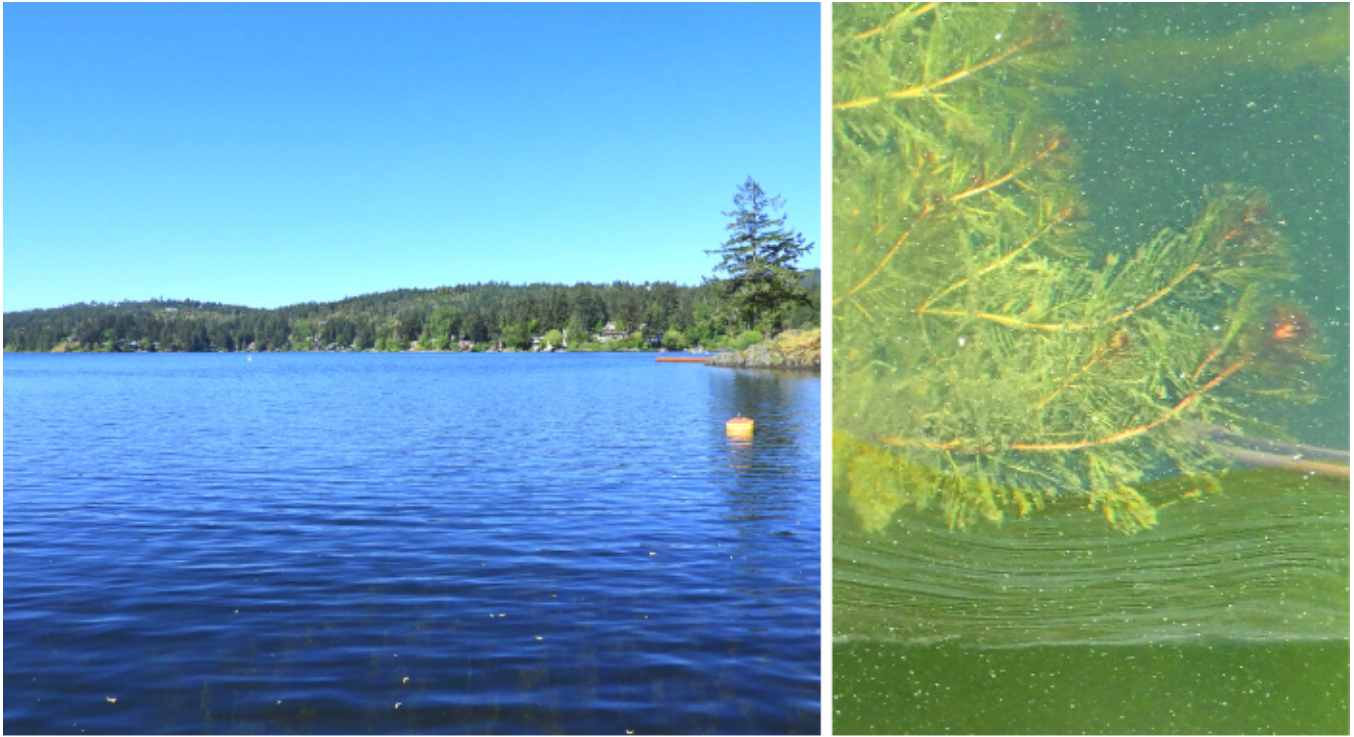
Eurasian Watermilfoil found at Prospect Lake, B.C.

Did you know that the most common aquatic invasive species found in the National Lake Blitz is Eurasian Watermilfoil ? This feather-like aquatic plant returns year after year to grow in thick mats right below the water's surface. It often outcompetes native species, reduces lake biodiversity and negatively impacts recreational activities including fishing, boating and swimming. Learn how to identify this invasive plant from the Invasive Species Centre .