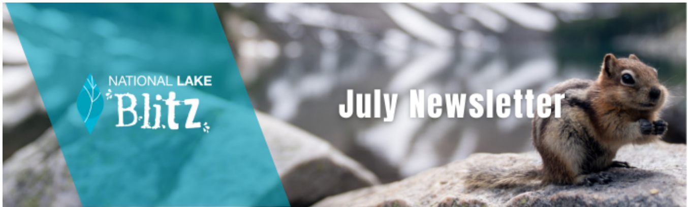
Lake Agnes, AB. 2023 Lake Biodiversity Photo Challenge.