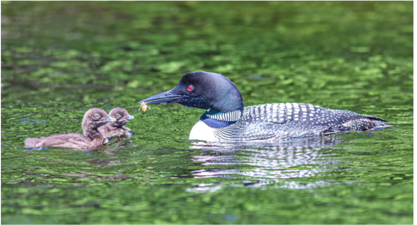
Kamanisseg Lake, ON. 2023 Lake Biodiversity Photo Challenge.

Need help identifying species while monitoring this season? iNaturalist is the perfect tool for the job. Download the app to your phone, snap a photo of a plant or animal and iNaturalist will help identify the species. Then join the National Lake Blitz Observations project on iNaturalist to share your observations and see what other volunteers are spotting at their local lakes. Over 180 observations have been submitted since the start of May!