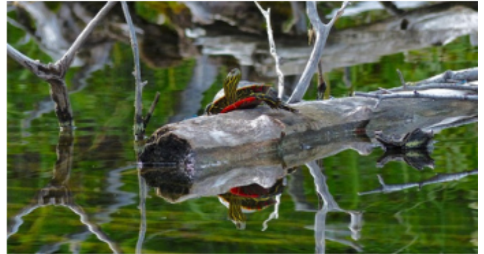
Wildlife living at Heffley Lake.

Located 30 minutes outside of Kamloops, B.C., Heffley Lake is a hub for water sports and fishing, and hosts a diversity of wildlife including painted turtles, rainbow trout, loons and more. That’s why we’re excited to welcome members of the Heffley Lake Stewardship Committee to the 2023 National Lake Blitz. Members are collecting water monitoring data, in addition to participating in their annual Heffley Lake Bird Count.