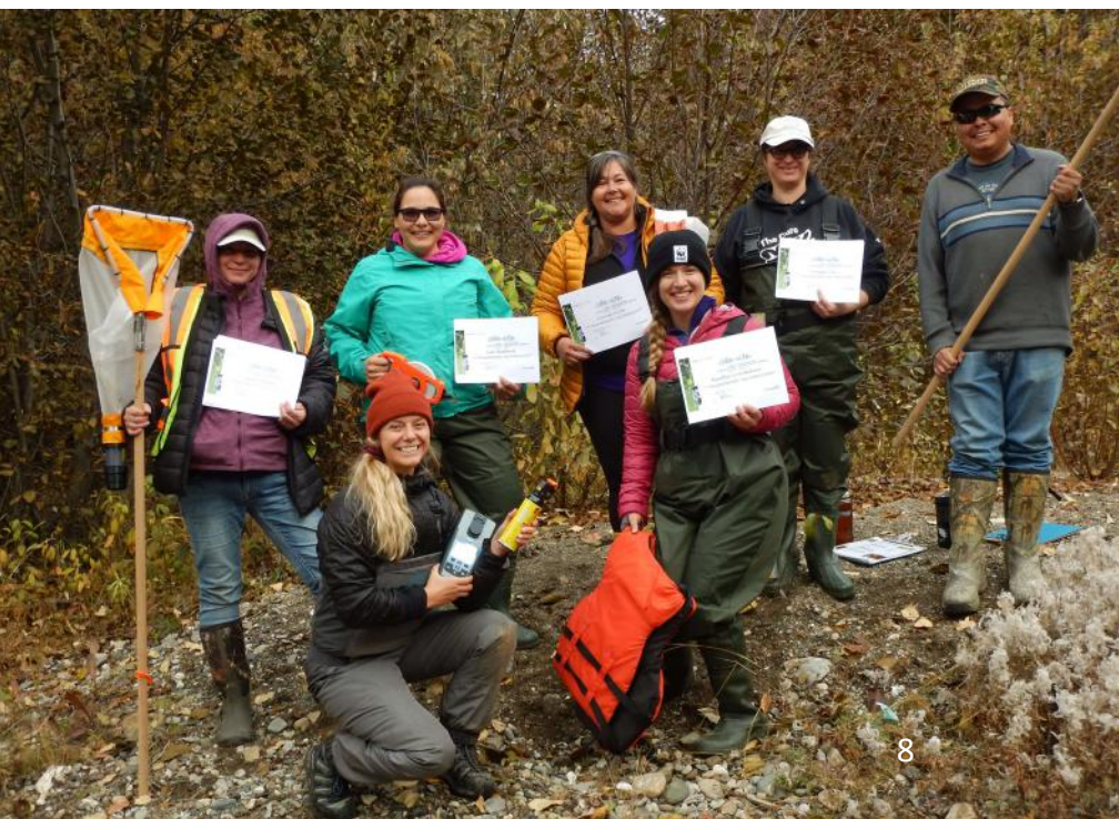
The Dane Nan Yé Dāh Land Guardian program celebrate graduating the 2-day CABIN field practicum in the Liard River Watershed hosted by Living Lakes Canada in partnership with WWF-Canada for the Dena Kayeh Institute.

Living Lakes Canada will continue to link Indigenous Knowledge and Western science for informed decision-making on joint watershed health evaluation and stewardship, effectively working toward on-the-ground examples of applied reconciliation.