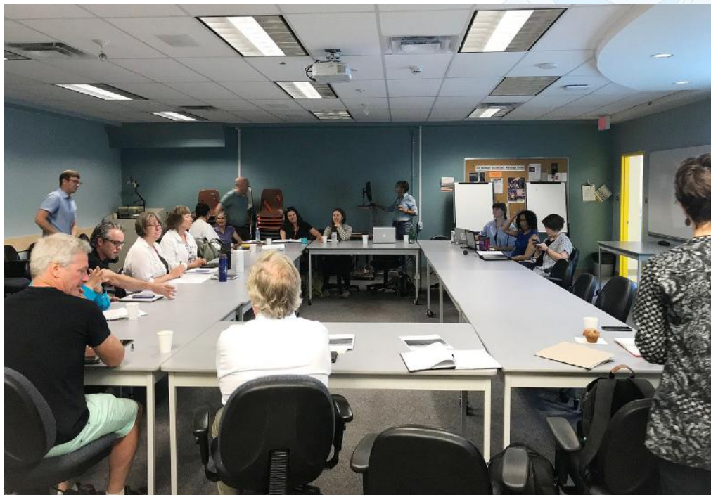
A Columbia Basin Water Monitoring Collaborative’s Steering Committee meeting in Nelson, BC.

In 2019, research was conducted on database models used by industry, governments, Indigenous and non-Indigenous communities, and non-profit organizations to assess what would best meet the Monitoring Collaborative’s open source database needs.