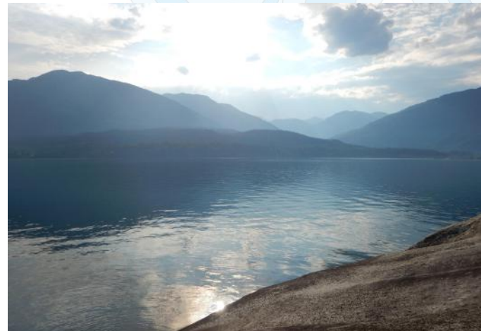
Living Lake Canada chairs the Kootenay Lake Partnership, which has a precedent-setting Shoreline Guidance Document incorporating Indigenous cultural values as well as ecological values.