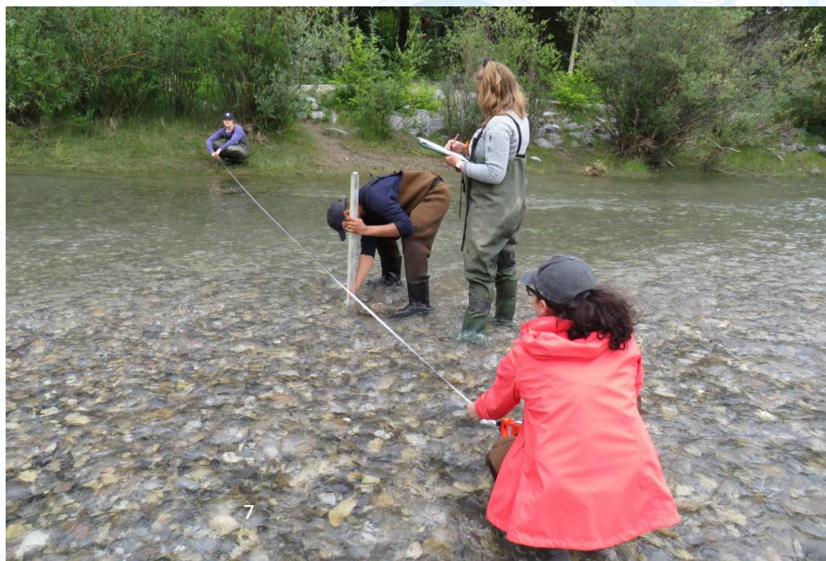
Bottom: Participants sampling one of 4 sites in the Canmore, AB CABIN-STREAM training in July 2019.