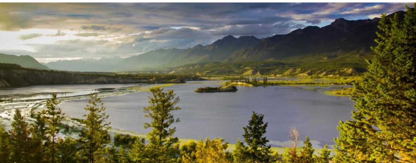
The Columbia Wetlands with the BC Rockies in the background.