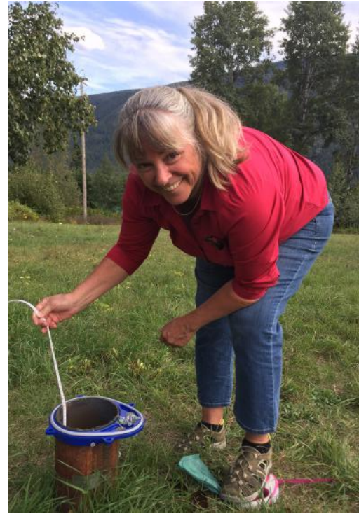
Well owners volunteer their wells to be part of the Columbia Basin Groundwater Monitoring Program.

Our Groundwater Monitoring Program collects groundwater level data, engages partners and citizens in the collection of data to increase knowledge and awareness about groundwater, and shares the data publicly so that it can be used to inform groundwater protection and management.