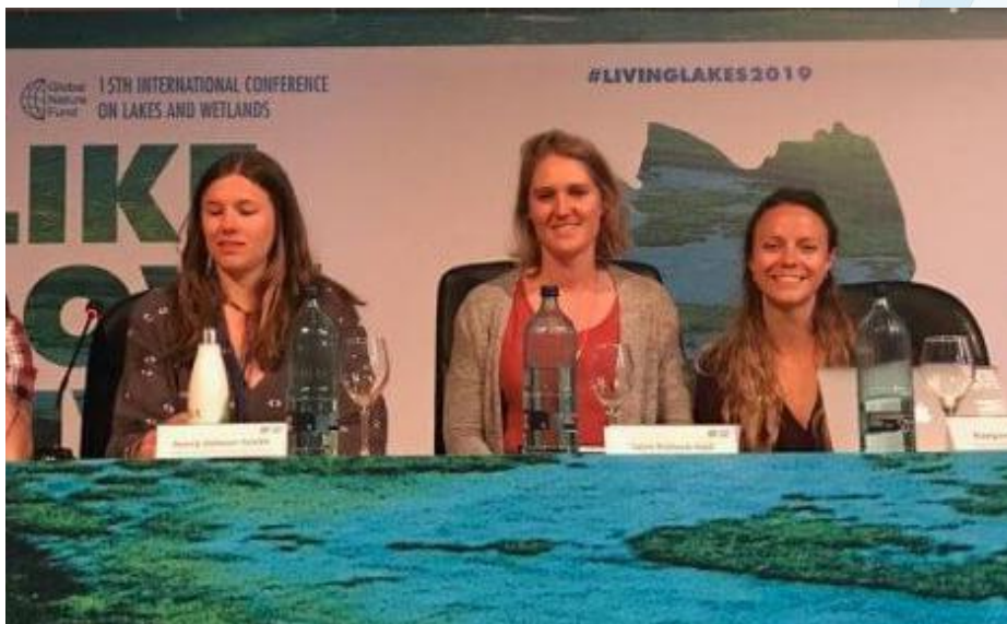
Top: Over 200 international delegates from 41 countries attended the Living Lakes International Conference on lakes and wetlands in Valencia, Spain.