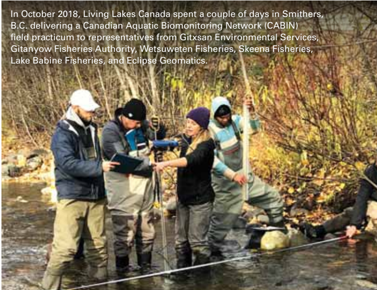
In October 2018, Living Lakes Canada spent a couple of days in Smithers, B.C. delivering a Canadian Aquatic Biomonitoring Network (CABIN) field practicum to representatives from Gitksan Environmental Services, Gitanyow Fisheries Authority, Wetsuweten Fisheries, Skeena Fisheries, Lake Babine Fisheries, and Eclipse Geomatics.