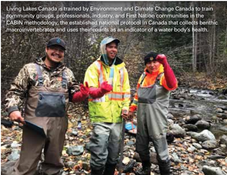
Living Lakes Canada is trained by Environment and Climate Change Canada to train community groups, professionals, industry, and First Nation communities in the CABIN methodology, the established national protocol in Canada that collects benthic macroinvertebrates and uses their counts as an indicator of a water body's health.