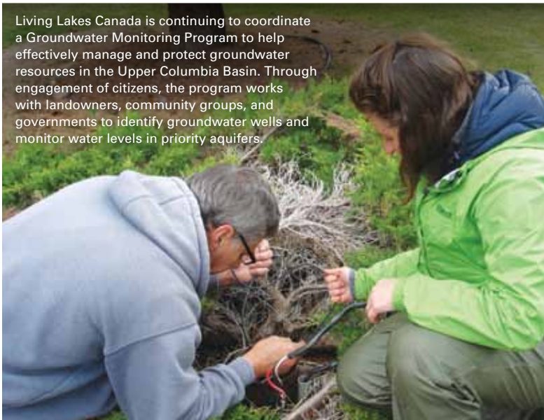
Living Lakes Canada is continuing to coordinate a Groundwater Monitoring Program to help effectively manage and protect groundwater resources in the Upper Columbia Basin. Through engagement of citizens, the program works with landowners, community groups, and governments to identify groundwater wells and monitor water levels in priority aquifers.